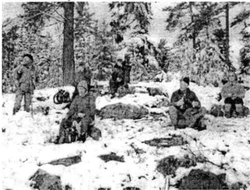
The camp site on Banana Lake

Dunlop Lake/Banana Lake - These trails are to be found off Dunlop Shores Road (Summers Lake Road as it used to be known). The new road will take you right down to the portage between Dunlop Lake and Gusty Lake.