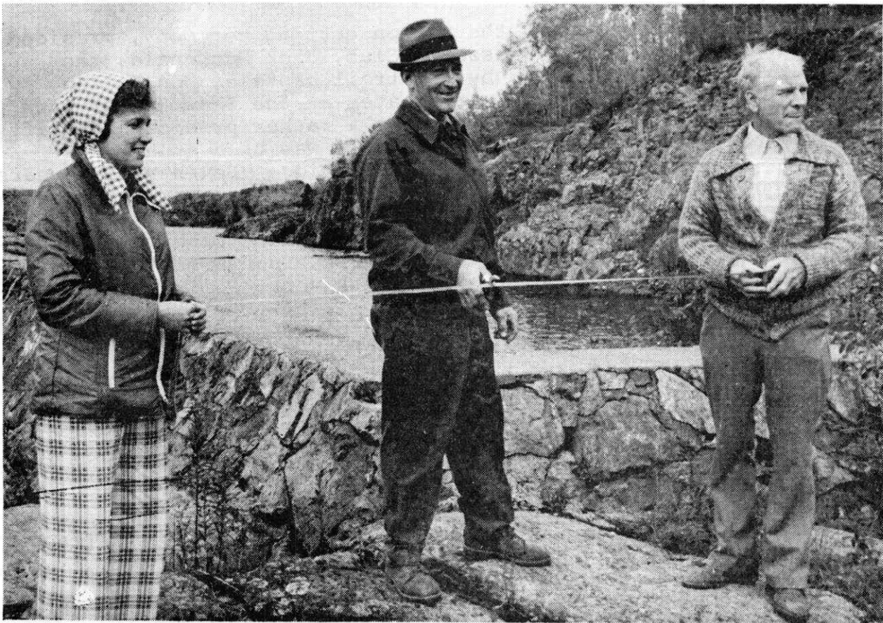
THE OPENING OF THE THESSALON SECTION 1978 10 01